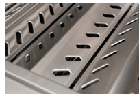
430 Grade Stainless Steel flame tamers