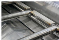
304 Grade Stainless Steel Tube Burners