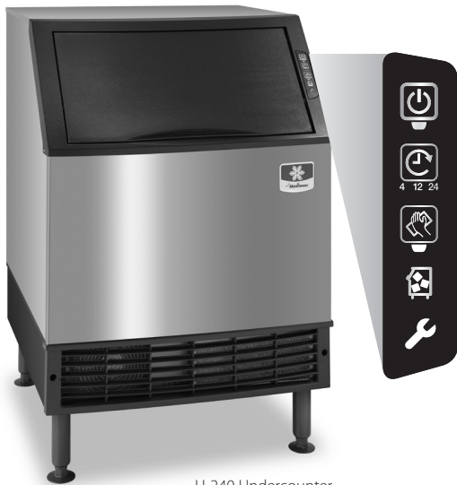
U-240 Undercounter Ice Machine