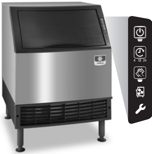
U-310 Undercounter Ice Machine