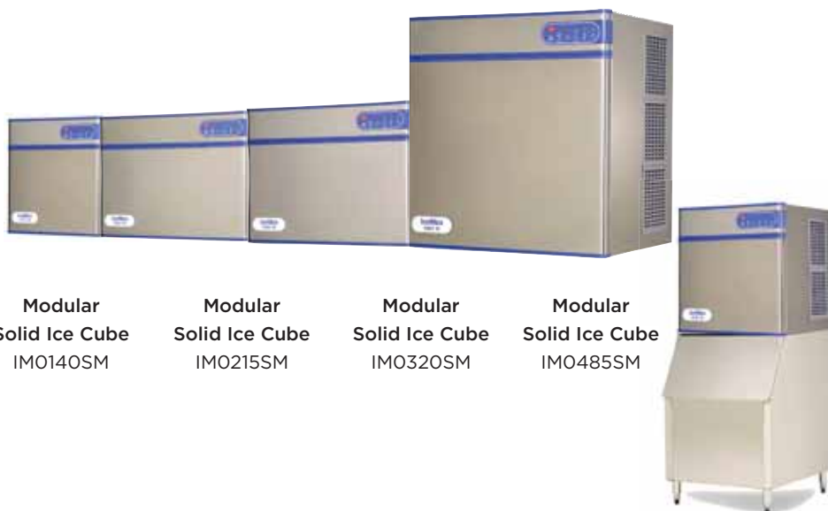
Modular Solid Ice Cube IM0140SM Modular Solid Ice Cube IM0215SM Modular Solid Ice Cube IM0320SM Modular Solid Ice Cube IM0485SM