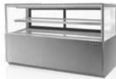
> Model SB1500-2RD