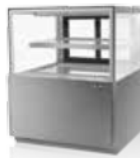
> Model SB1500-2RD