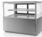
> Model SB1500-2RD