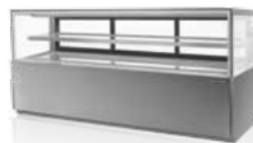
> Model SB1500-2RD