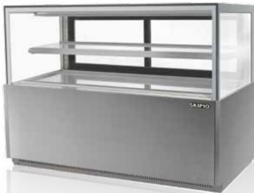
> Model SB1500-2RD