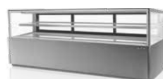
> Model SB1500-2RD